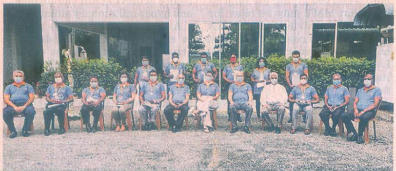
Group Directors with the service award winners for 2021